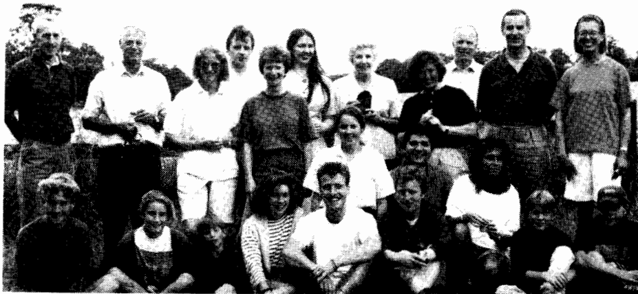
Powerscourt Wingfield's meet in London for reunion